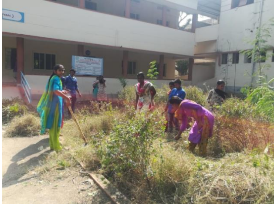
Harmony in nature