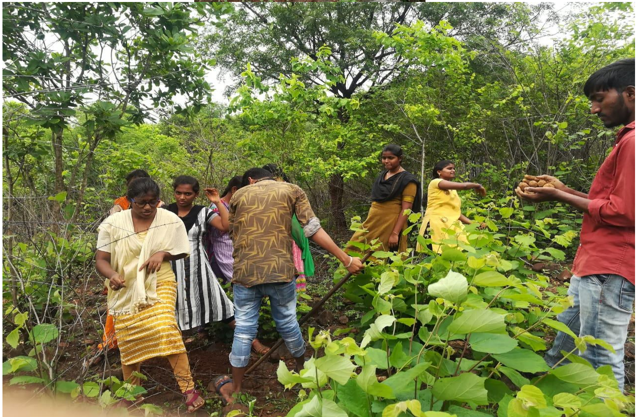
Spreading seed balls in the forest